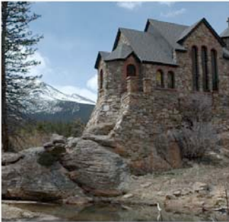
St. Malo Allens Park, Colorado

pick out 3-4 trees that might be 'worthy' of showing this year.... even if they all don't make it to the show I know that they will become the best trees in my collection just because I will give them the attention that they deserve.