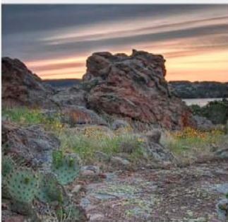
Inks Lake State Park