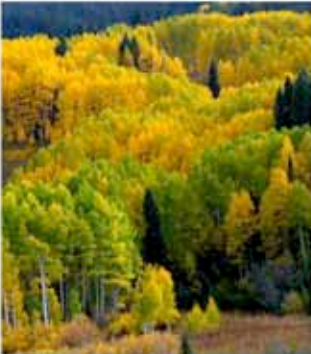
Changing Aspens Boulder, Colorado